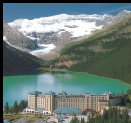
Beautiful Lake Louise