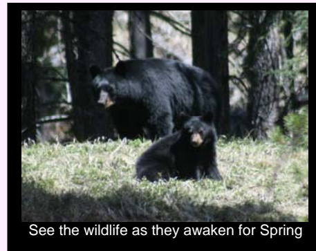
See the wildlife as they awaken for Spring