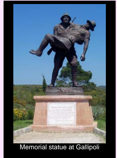
Memorial statue at Gallipoli

Transfer to the pier and take the hydrofoil to Rhodes. Transfer to hotel and overnight in Rhodes. (B)