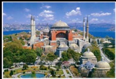
Aya Sophia - Istanbul