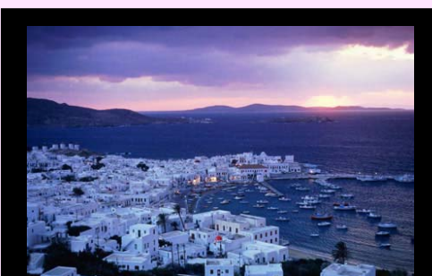
Mykonos - Greece

* based on minimum group of 10 and subject to currency fluctuations