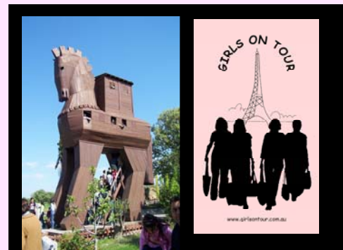
Trojan Horse at Troy