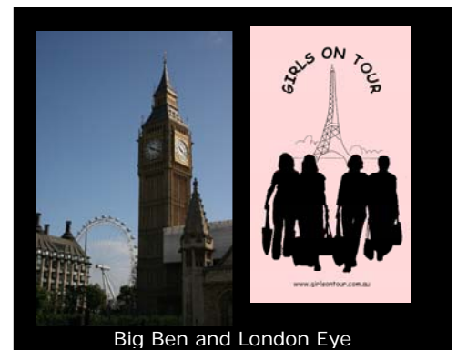
Big Ben and London Eye