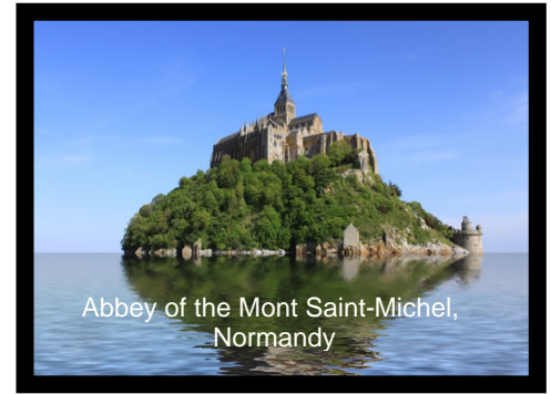
Abbey of the Mont Saint-Michel, Normandy

Visit Saint Malo, the city of pirates. After lunch on your own enjoy a guided visit of the abbey of Mont Saint Michel. Continue to Angers for dinner and overnight. (B, D)