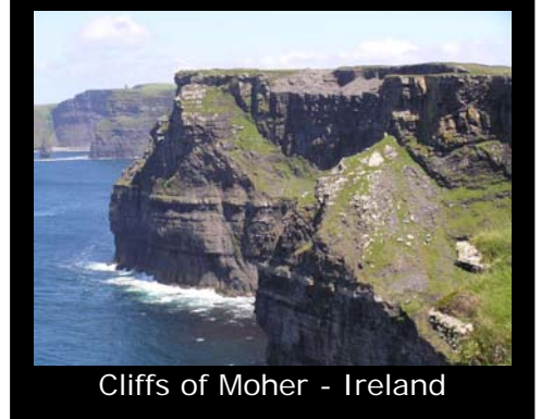
Cliffs of Moher - Ireland

Coach transfer with guide for sightseeing to Plymouth via Penzance,