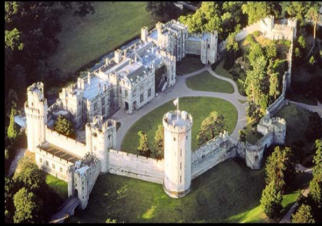
Warwick Castle - England