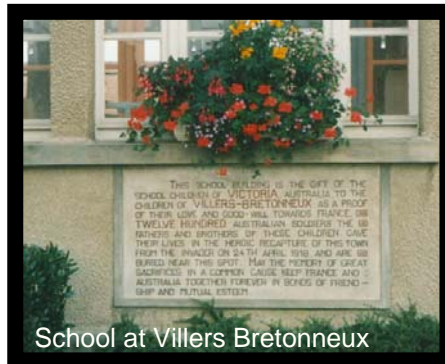
School at Villers Bretonneux

Cost twin share $1,860. Single Supp $890